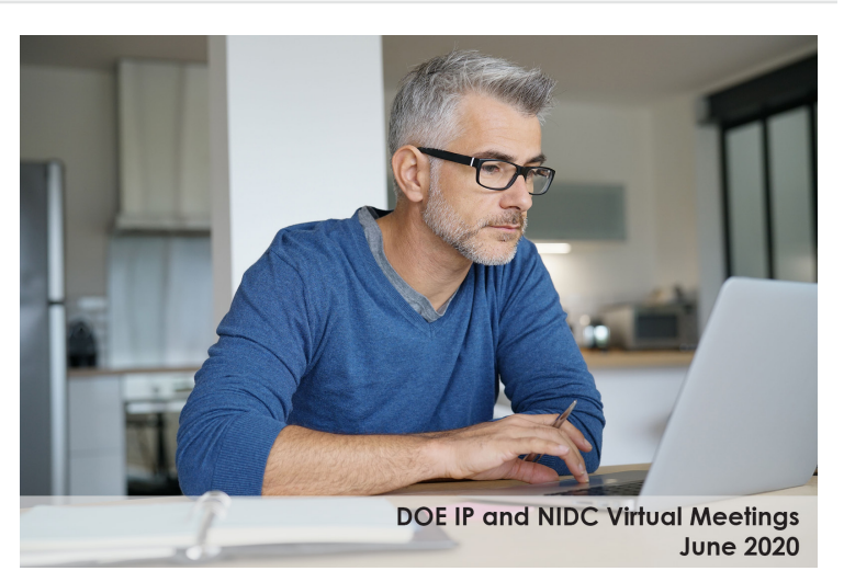
DOE IP and NIDC Virtual Meetings

The DOE IP has decided to move most of our meetings to an online forum including our isotope-specific user group meetings, and one-on-one stakeholder meetings. More information on dates and times for each of our sessions will become available in the coming weeks. If you or your organization is interested in scheduling a one-onone stakeholder meeting, email sikeskg@ornl.gov to request your meeting date and time.