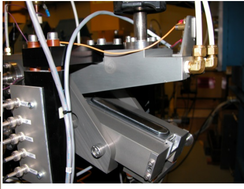
Jaw Open with Target Displayed